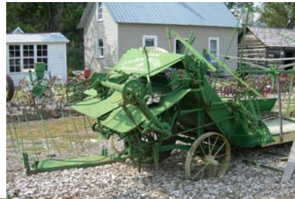
Examples of some of the machinery on display.