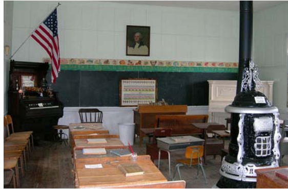
1880's One Room School House