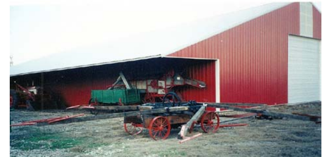
12 horse power unit

We hope you will enjoy the display, and plan for a return visit, as the collection continues to grow.