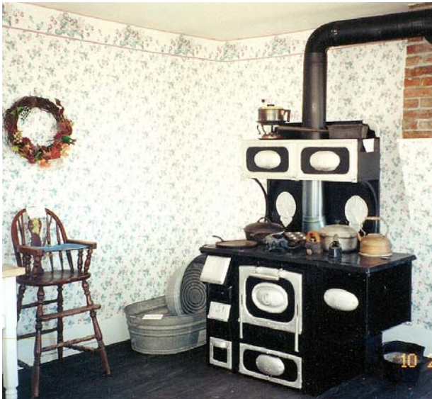
Views inside the 1880's two-room house.